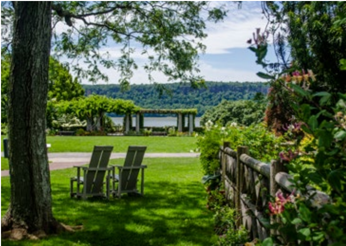
The Pergola and Great Lawn at Wave Hill

Often called “one of the greatest living works of art,” Wave Hill is a spectacular public garden and cultural center overlooking the majestic Hudson River and Palisades in the Riverdale section of the Bronx. A short ride farther north on the Hudson River, Lyndhurst Mansion boasts a Gothic Revival mansion that sits on its own 67-acre park. Experience these gems on the Hudson River on a day filled with history, beauty, serenity, and much more.